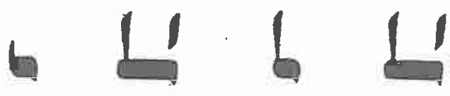
DISQUE DE PROTECTION